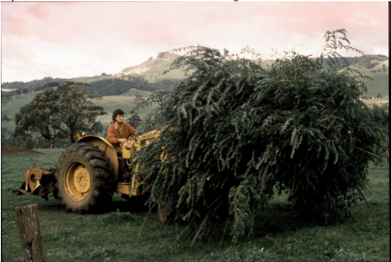
Moving tree fodder with front end loader Victorian Tree Crop nursery Ellinbank Gippsland 1988

Pollarding by hand with long handled double action professional forestry loppers can be very efficient cutting wood up to 40mm. Hydraulic lopper are an option. These willow wands up to 3 m from two years growth will fall freely to the stream bank for direct grazing by livestock following the cutting. Material which falls in the stream does not significantly increase likelihood of willow spread especially if cut in summer. If mob stocking is very brief with stock moved every day or two the impact on the stream banks and other established native vegetation would be minimal.