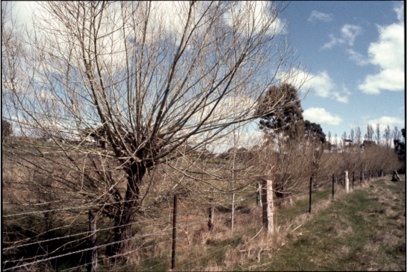
Willows pollarded for fodder Campbells Ck central Vic from Trees On The Treeless Plains HDS 1994

Depending on the rotation of cutting, pollarding substantially increases the amount of sun reaching the water and riparian zone. This allows for a more diverse aquatic ecology and the natural regeneration or supplementary planting of indigenous vegetation which is the main aim of removal projects.