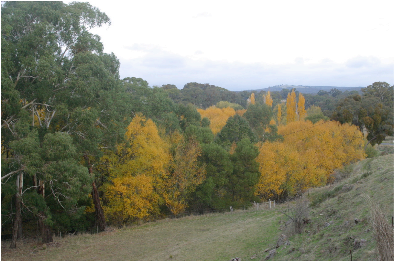
Jim Crow Ck at Shepherds Flat centra Victoria with mixed native and exotic vegetation including willows typical of grazing landscapes targeted for willow removal.

Over recent years willow removal projects have become a major component of Federal and State funded Landcare programs in south eastern Australia. This work is driven by willows ( Salix spp) being classified as a Weed of National Significance 1 , and an extensive cross government network to co-ordinate action 2 including adding willows to the noxious weeds list (restricted from sale at this stage 3 ). Most of these projects have been in high rainfall agricultural landscapes where willows form riparian forest corridors through grazing land. A smaller proportion has been in urban and peri-urban ungrazed landscapes radically changed by successive adjacent landuses and urban runoff. Some have been in high conservation value streams in national parks, although willow spread in these areas is relatively uncommon.